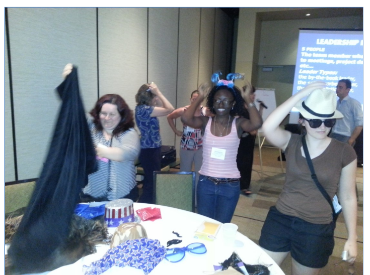
Role playing volunteers preparing for their parts with props and costumes:

Women in Engineering: ieee.org/women IEEE WIE Facebook page IEEE Region 3 Women in Engineering on Facebook